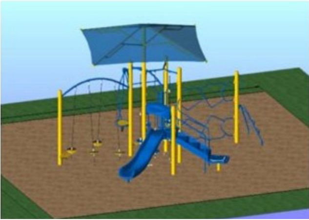
Paid for by the PTA

Thanks to the success of our annual Read-a-Thon, enough funds were raised to purchase the pictured playground equipment. Students were allowed to vote on which color combination they liked best; the picture shows the winning combination. The installation is scheduled to begin the week of August 14th with the hope that it will be complete for the new school year. Please be cautious during installation when enjoying the rest of the elementary playground equipment, but also revel in anticipation of the new addition! In addition to the funds raised, the success of the Read-a-Thon shows in our students' enthusiasm to read at school and for pleasure. Please encourage reading year-round; this will lead to a much smoother educational experience and enjoyment outside school.