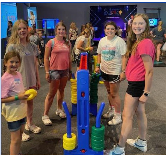
◀ CONNECT FOUR! Ida Middle School students play a competitive game of Connect Four while making CONNECTIONS with Elementary Students at the Michigan Science Center.

Until next summer, let us hold on to the memories we've created and carry the spirit of adventure in our hearts.