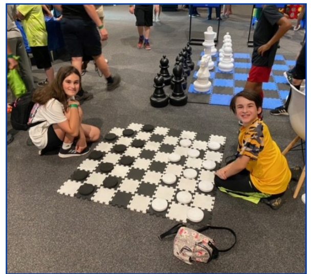
▲ LEVEL UP! A friendly competition ensues between friends visiting the Level Up space at the Science Center in Detroit.

▶ CHALLENGE ACCEPTED! Middle school students take their gaming skills from the screen to real-life challenges.